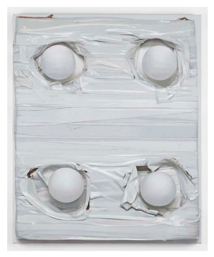
Neil Gall, "Kitchen (Velázquez)" (2015), oil on linen, 29.13 x 23.82 inches (click to enlarge)

That these depths and shadows emerge from feats of photorealism lends them a seriousness as well as a strange ambiguity.