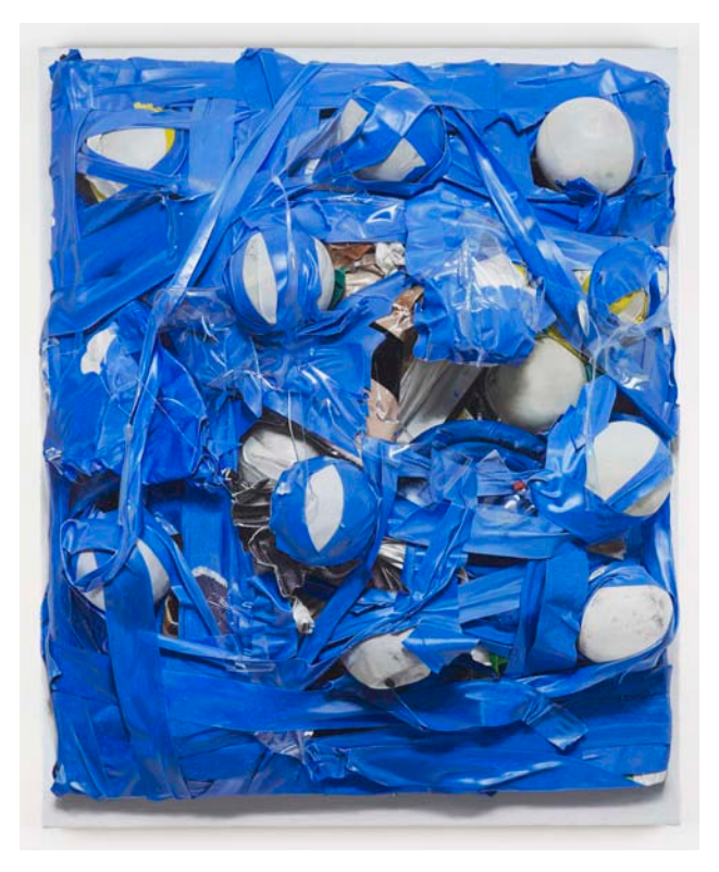
Neil Gall, "Allegory (Bronzino)" (2014), oil on linen, 29.92 x 24.41 inches

Gall's previous work explored monstrous, creature-like models of taped-together Ping-Pong balls, often posed against plain backgrounds, which called to mind the work of 17<sup>th</sup>-century painter Giuseppe Arcimboldo, as well as the mannequins in the Metaphysical paintings of Giorgio de Chirico, the Surrealist landscapes of Salvador Dalí and Yves Tanguy, and the biomorphic dolls of Hans Bellmer, and suggested various sexualized scenarios of bondage. The feeling of bondage in Gall's work continues in this show, but encompasses the background as well as the figure, and in fact confuses and entangles the two. The drawing "Ghost" (2015), its edges pulled and torqued, approximates a diamond. The tape performs two roles: as a background, it subsumes the figures within it (the white orbs); as part of a three-dimensional model, it also acts as the dominant figure in the composition.