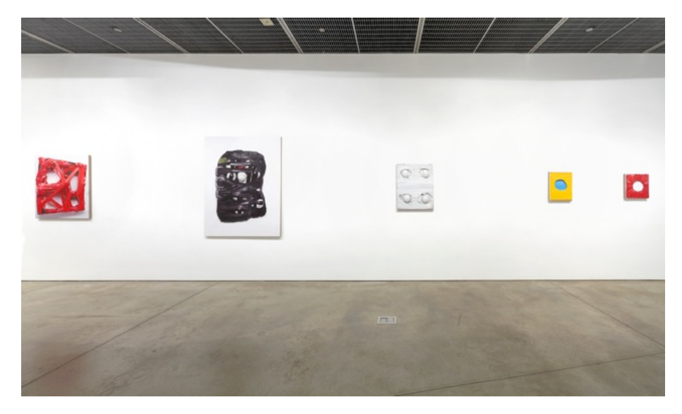
Installation view of "Neil Gall: Cut-Outs, Offcuts and Holes" (2015)