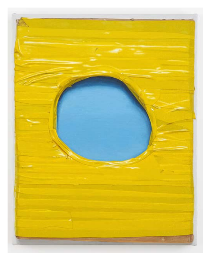
Neil Gall, "Sky Hole" (2015), oil on linen, 18.5 x 14.76 inches

The soft, exposed pencil lines of Gall's drawings — displayed at the back of the gallery and in a small adjoining room — reveal immediately their two-dimensional status and offer greater nuance in terms of layers and colors than his paintings. Colored pencil lines overlap in crosshatched grids; light reflects from the translucent plastic wrapping; the edges gradually fade into a purple haze created by gridded red and blue pencil lines. Up close, these works seem perhaps more attuned to the details and intricacies of the materials dangling and overlapping in uneven borders. A few strands of string or yarn wind in curlicues. Whereas brushstrokes are not visible in Gall's paintings, here pencil lines are apparent, creating a feeling of intimacy with the work as a crafted thing. The figure blends into its background, and the composition merges into the white paper surface. The represented folds in the drawn object echo the actual folds of the material paper.