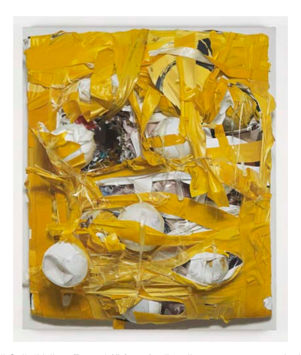
Neil Gall, "Yellow (Poussin)" (2014), oil on linen, 29.13 x 24.41 inches

In Neil Gall's newest paintings, which are currently being exhibited at David Nolan (April 30 – June 13, 2015), there is a powerfully coercive interplay between figure and background that veers between the unstable and the terrifying. Uneven, jagged holes, cut out of tapewrapped canvases, become resting places for large, perfectly white, almost moon-like spheres (as in the all-white "Kitchen (Velasquez)," 2015). Sometimes the orbs are not perfectly round but punched or crunched. It is only on second glance that these prove to be not sculptures but paintings, examples of dazzlingly skillful photorealism.