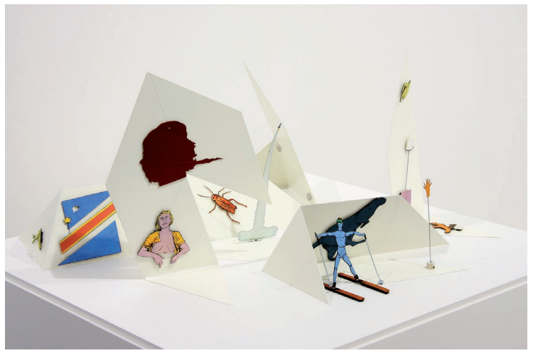
Öyvind Fahlström, White House, 1968, Variable structure, magnetic elements, Enamel and tempera on metal, vinyl, 31 x 63,5 x 74 cm