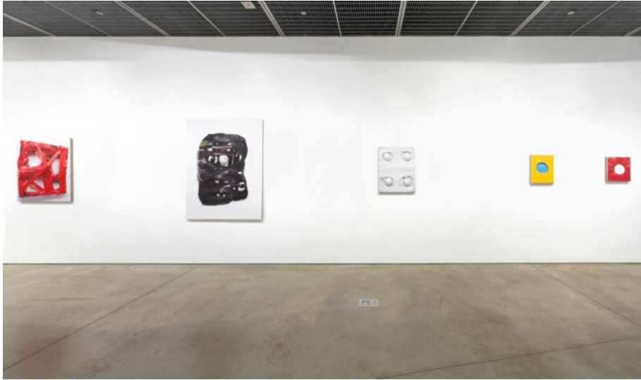
Installation view of "Neil Gall: Cut-Outs, Offcuts and Holes" (2015)