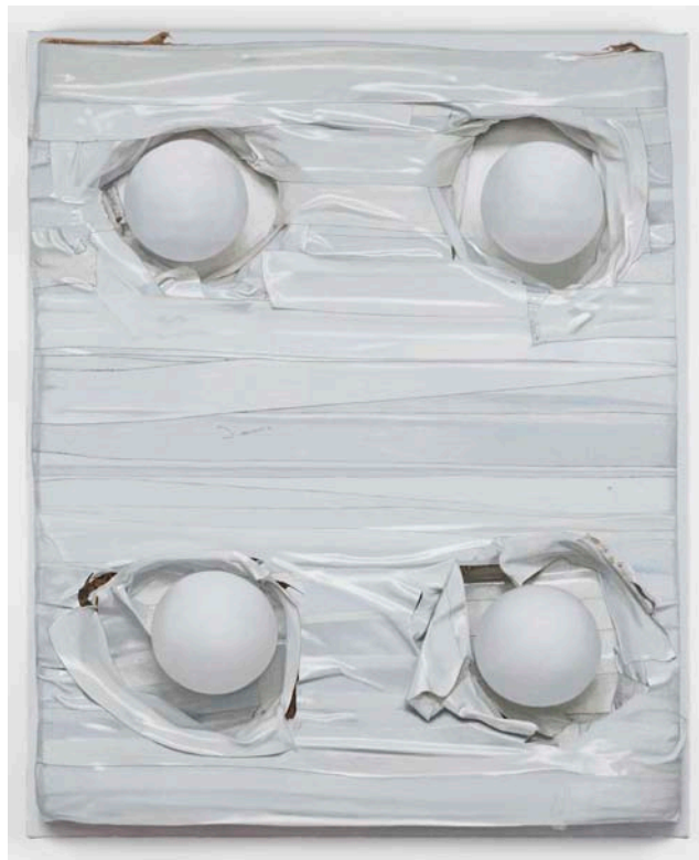
Neil Gall, "Kitchen (Velázquez)" (2015), oil on linen, 29.13 x 23.82 inches (click to enlarge)

That these depths and shadows emerge from feats of photorealism lends them a seriousness as well as a strange ambiguity.