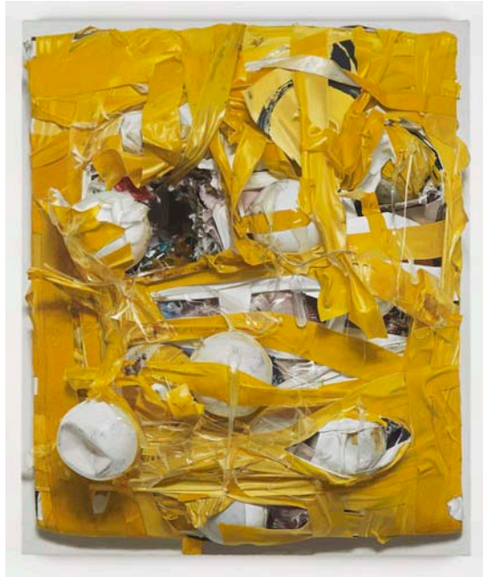
Neil Gall, "Yellow (Poussin)" (2014), oil on linen, 29.13 x 24.41 inches