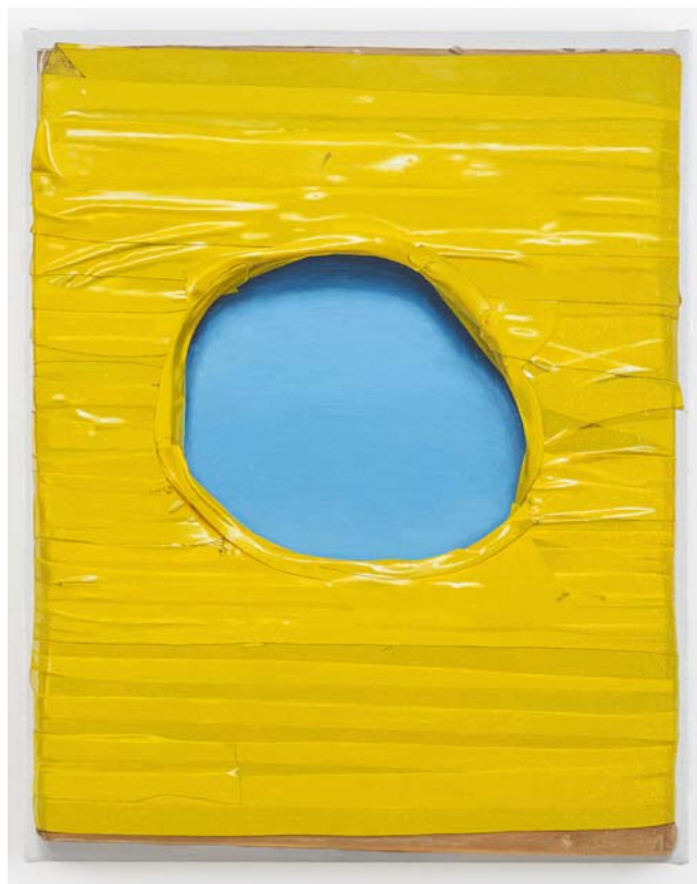
Neil Gall, "Sky Hole" (2015), oil on linen, 18.5 x 14.76 inches

The soft, exposed pencil lines of Gall's drawings — displayed at the back of the gallery and in a small adjoining room — reveal immediately their two-dimensional status and offer greater nuance in terms of layers and colors than his paintings. Colored pencil lines overlap in crosshatched grids; light reflects from the translucent plastic wrapping; the edges gradually fade into a purple haze created by gridded red and blue pencil lines. Up close, these works seem perhaps more attuned to the details and intricacies of the materials dangling and overlapping in uneven borders. A few strands of string or yarn wind in curlicues. Whereas brushstrokes are not visible in Gall's paintings, here pencil lines are apparent, creating a feeling of intimacy with the work as a crafted thing. The figure blends into its background, and the composition merges into the white paper surface. The represented folds in the drawn object echo the actual folds of the material paper.