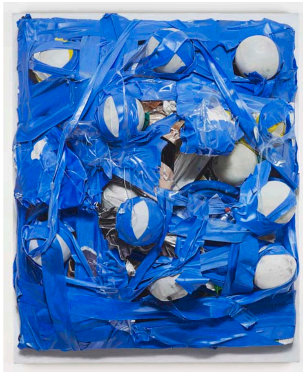
Neil Gall, “Allegory (Bronzino)” (2014), oil on linen, 29.92 x 24.41 inches

Gall’s previous work explored monstrous, creature-like models of taped-together Ping-Pong balls, often posed against plain backgrounds, which called to mind the work of 17 th -century painter Giuseppe Arcimboldo, as well as the mannequins in the Metaphysical paintings of Giorgio de Chirico, the Surrealist landscapes of Salvador Dalí and Yves Tanguy, and the biomorphic dolls of Hans Bellmer, and suggested various sexualized scenarios of bondage. The feeling of bondage in Gall’s work continues in this show, but encompasses the background as well as the figure, and in fact confuses and entangles the two. The drawing “Ghost” (2015), its edges pulled and torqued, approximates a diamond. The tape performs two roles: as a background, it subsumes the figures within it (the white orbs); as part of a three-dimensional model, it also acts as the dominant figure in the composition.