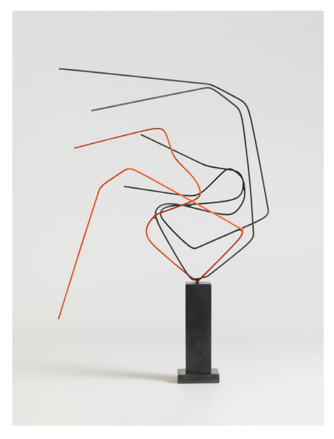
Norbert Kricke, Raumplastik Schwarz-Rot, 1955, Steel, painted